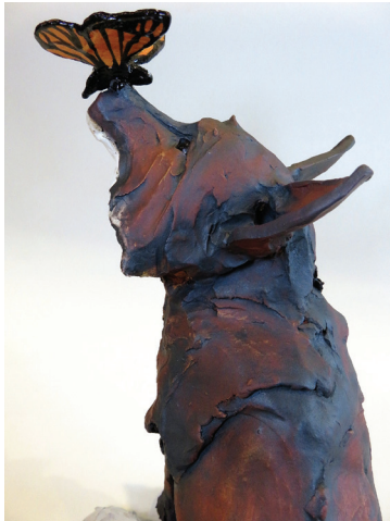
Figure 1. Kylie Matheson, Fox and Butterfly , 2019, ceramic, hand-built paper clay, oxide wash and engobe, 280 × 240 × 250 mm.

A butterfly alights delicately on a fox's nose. Is it an unintended passing encounter or a greeting of two unexpected friends: Butterfly and Fox? We bring our own dialogue to this silent moment of innocence and trust. Kylie Matheson's hand-built sculptures evoke an emotional response in the viewer, of curiosity and wonder. Drawing inspiration from animals and their behaviour, Matheson focuses on the secret relationships between her characters and draws in the viewer, to create their own narratives between the ceramic duos and scenes she creates between them.