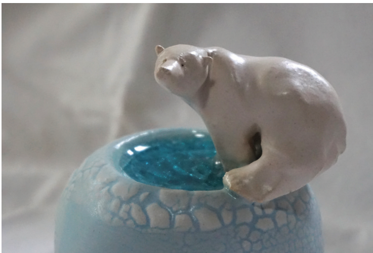
Figure 4. Kylie Matheson, Polar Bear , 2019, ceramic, hand-built paper clay, oxide wash and engobe, 100mm x 100mm x 110mm.

Rabbit goes on long adventures. There's no owl and the pussycat aboard her green vessel, just Rabbit setting off alone into the unknown in her small wooden skiff. Adrift on a windowsill, mantle-piece or table. Sometimes peering over the side, or at the bow looking for land ho, sometimes lying back with legs crossed in contemplation of the clouds in the sky. Always on the way, never arriving.