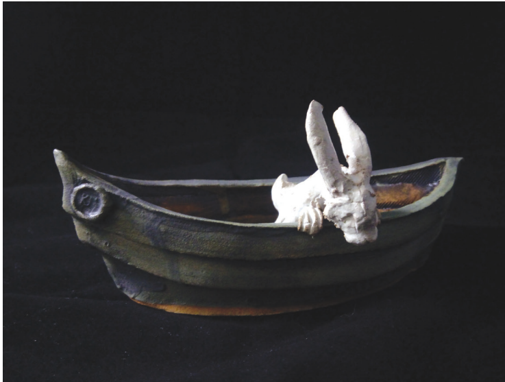
Figure 3. Kylie Matheson, The Drifters , 2019, ceramic, hand-built paper clay, oxide wash and engobe, 170mm x 90mm

Rabbit goes on long adventures. There's no owl and the pussycat aboard her green vessel, just Rabbit setting off alone into the unknown in her small wooden skiff. Adrift on a windowsill, mantle-piece or table. Sometimes peering over the side, or at the bow looking for land ho, sometimes lying back with legs crossed in contemplation of the clouds in the sky. Always on the way, never arriving.