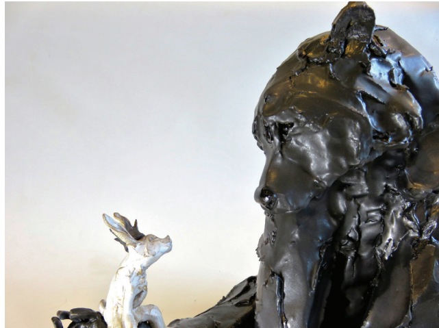
Figure 2. Kylie Matheson, Grizzly and Queen Rabbit , 2019, ceramic, hand-built paper clay, satin glaze, 280 × 250 × 340 mm.