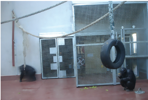
Figure 12. The indoor chimpanzee enclosure Wellington Zoo, 2013, photograph by Irena Kennedy.

Artificial nature and man-made environments have played a significant role in my art works. These environments, that captive animals are expected to spend their living days in, seem so far from their land of origin. The modern zoo is focusing more on bioclimatic enclosures, including species diversity, environmental weather control, and with spaces for the animals to hide. Some focus on enrichment-based enclosures. The chimpanzee enclosure at Wellington Zoo (New Zealand), features an outside area with climbing frames and a large play space. The inside feeding area is the old enclosure, and appears cold and archaic, with its tiled floors and the only stimulus in rope and tyre swings (Figure 12). These enrichment enclosures are seen to help keep the animal stimulated and engaged, instigating play. For the exhibition Traversing the Zoo , I also produced enrichment devices, mimicking those found in zoos. The idea that such a device might stimulate an animal for a prolonged period of time, saddens me, as the animals I worked with (particularly the monkeys) moved quickly between tasks. A ceramic tyre swing (Figure 13) was exhibited in Traversing the Zoo . I sculpted this in white clay, to enhance the feeling of fragility around time, with the suggestion of sterility creating a feeling of loneliness.