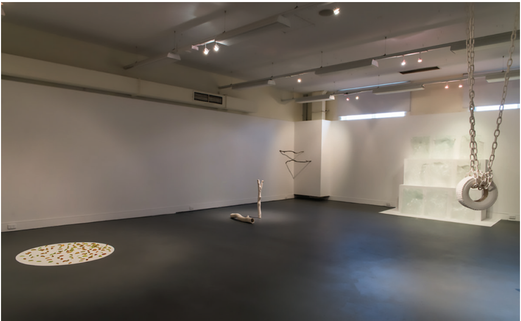
Figure 14. Irena Kennedy, Traversing the Zoo , 2014, photograph by Theresa Harrison.