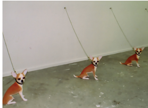
Figure 4. Irena Kennedy, Chihuahuas , 2006, fiberglass, flock, glass eyes, photograph by Irena Kennedy.