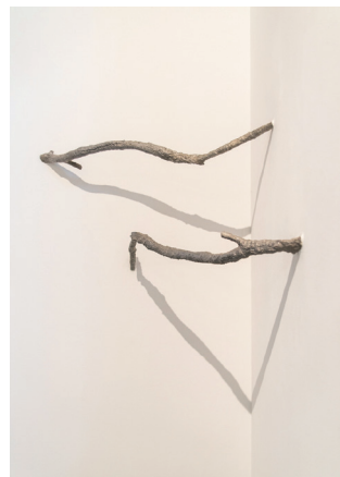
Figure 11. Irena Kennedy, Perch , 2014, aluminium.