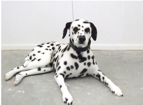
Figure 3. Irena Kennedy, Dalmatian , 2006, fiberglass, flock, glass eyes.