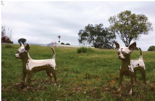
Figure 7. Irena Kennedy, Bronze Chihuahuas , 2013, photograph by Irena Kennedy.

installation of this work was staged in a walled-in room that the viewer could only visually access by crawling on hands and knees into a dog cage (Figure 6). This controlled and positioned the viewer, executing a role reversal with the companion animal being the alpha; although the dogs were chained to the walls a dichotomy of control was present.