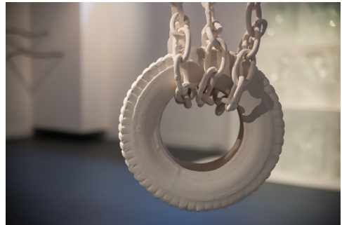
Figure 13. Irena Kennedy, Ceramic Tyre Swing , 2014, white clay, photograph by Theresa Harrison.