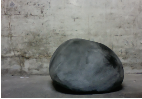
Figure 8. Irena Kennedy, Cement Rock , 2010, cement, photograph by Irena Kennedy.

"Nature, a Transcendental term in a material mask, stands at a potentially infinite series of other terms that collapse into it, otherwise known as a metonymic list: Fish, grass, mountain, air, chimpanzees, love, soda water; freedom of choice, heterosexuality, free markets... Nature. A metonymic series becomes a metaphor. Writing conjures this notoriously slippery term, useful to ideologies of all kinds in its slipperiness, in its refusal to maintain any consistency." 13