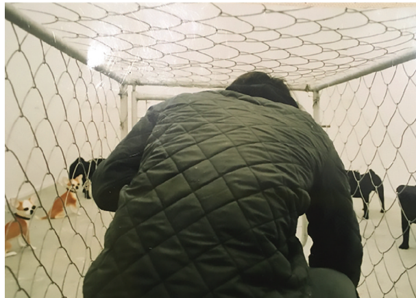
Figure 6. Irena Kennedy, Best in Show , 2006, photograph by Irena Kennedy.

installation of this work was staged in a walled-in room that the viewer could only visually access by crawling on hands and knees into a dog cage (Figure 6). This controlled and positioned the viewer, executing a role reversal with the companion animal being the alpha; although the dogs were chained to the walls a dichotomy of control was present.