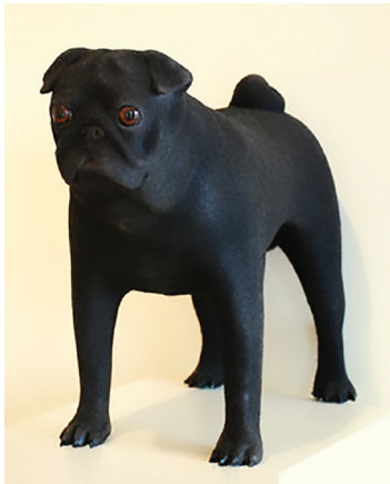
Figure 5. Irena Kennedy, Pug , 2006, fiberglass, flock, glass eyes, artwork by.