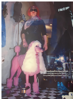
Figure 1. Pink Poodle, image of performance in Bellbird retail shop

In her companion species manifesto, Haraway has used terms such as cohabitation, symbiotic relationship, and companion animal in some of her analysis of domesticated dogs' relationship with their human companions. Her terminology, relating to this notion of companion species, speaks to an inter-relationship with non-human animals, which is genuine and equal, and contrasts with terms like master, owner, and parent (all terms of hierarchy). Haraway's referral to the Western world's "furry children", in the opening quote, resonates, when associated with pop culture and media influence. I was reading such texts in 2005, when Paris Hilton was at the height of social influencing, and constant media images of her chihuahua, Tinkerbell, appearing in her hand bag adorned with clothing and jewels matching that of her human companion, set the stage for fashion trends of accessorised companion animals. 2 Although the use of animals as accessories was not an entirely new concept, the media attention that this drew set off worldwide trends. Adornment of dogs, coupled with dyed hair and painted claws, anthropomorphised the non-human companion.