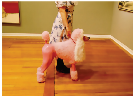
Figure 2. Pink Poodle , image Dunedin Public Art Gallery, photograph by Anne Basquin.