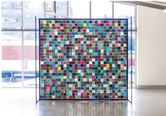
Figure 5. The Great Filter , part of the collection Where is Away? , 2018, photograph by Lana Young.

This "wall" forces the viewer to renegotiate the space, one work from one side, and a completely different one from the other, as light highlights and darkens certain colours and interacts with others. The see-through quality of plastic means the work changes and interacts with natural light and movement in the space. This addresses photodegradation and its impacts on the food-chain, while also responding to the natural environment outside the gallery.