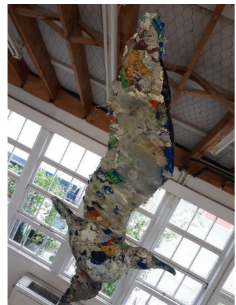
Figure 1. Tori Clearwater: Pacific Ocean , Part of the collection The Anthropocene , 2017.

In this work I embraced the symbolism of the animal, I used it to my advantage and including how people would view the work. Even the space reflected how we view nature in a constructed way, as the mezzanine above the space acted as a viewing platform.