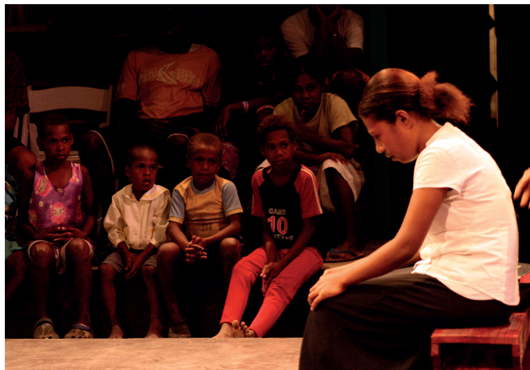
Figure 2. 40 Dei , a Wan Smolbag play about the conflicts of Kustom culture and Christianity, domestic violence, and addiction, Port Vila 2009.

Ana: Well, the first assignment was between 2008-09, for two years, working with an NGO (non-government organisation) which has been working in the Pacific for over 25 years; they are a development theatre group, 'Wan Smolbag', aiming to create awareness and engagement around education, health, governance, the environment, youth and gender. My role was training and supporting several counterparts in designing and developing publications which supported the educational work that they do primarily through theatre and storytelling. The publications we produced were used by teachers, villages' leaders, community and health workers - locally and in the wider Pacific.