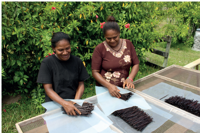
Figure 3. Vanilla growers packing freshly cured vanilla pods ready for market, Venuii, Espiritu Santo, 2012 (Photo credit: Ana Terry).

It was what you call an ‘in-line aid position’; you’re given a specific short-term project which doesn’t directly involve training a counterpart. However, from my point of view, volunteering is all about empowering people – so you just naturally want to do this. Otherwise, it’s like, well, I’ll just stay at home and do the job... and at the same time, I was working with staff members through Farm Support Association (FSA), which is a cooperative, working with local farmers, supporting them by providing education programmes and resources.