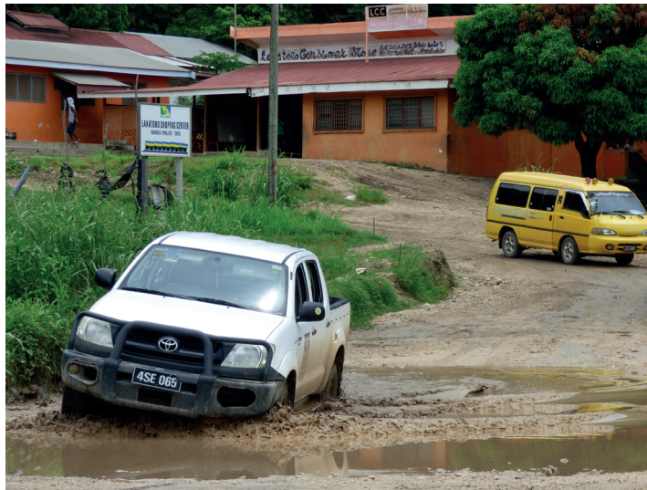
Figure 6. A typical wash out after heavy rainfall. Lakatoro, Vanuatu, 2017.