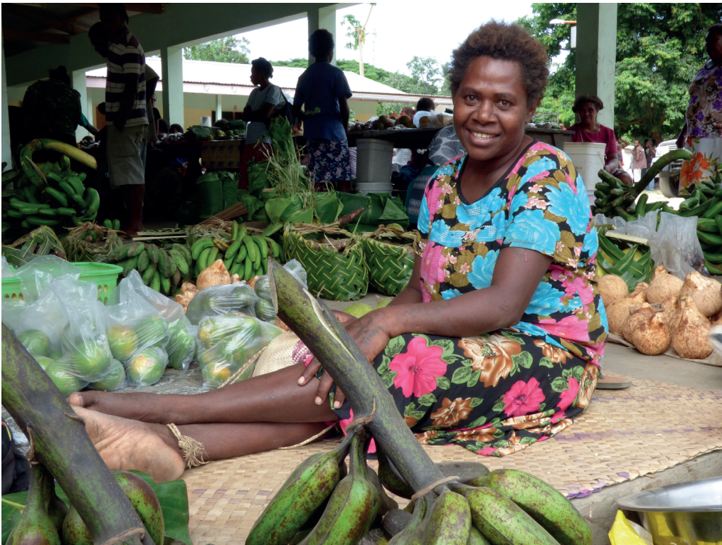
Figure 5. Mamas' market, at Lakatoro, Malekula, 2016.

Ana: Communication advances have made a huge difference to the islands. Even on the remotest island, cellular technology was surprisingly reliable. Cell phones are so vital – because transport is unreliable and the coral roads are often washed out... so the 'mamas' coming from the villages to sell fresh produce at the local market, can check in before harvesting if the transport is going to be available – or if there has been a big rainfall which will stop them from getting there. Getting accurate information on cyclones and weather events has also dramatically improved through cellular technology. I remember the hourly text messages coming through when Cyclone Donna - a Category 2 - was dancing around the top of our island for about 48 tense hours. We were lucky that the centre of it never hit us but it moved north and took out a whole island – about 1000 locals lost their homes and ended up sheltering in caves - with little water or food for more than two weeks.