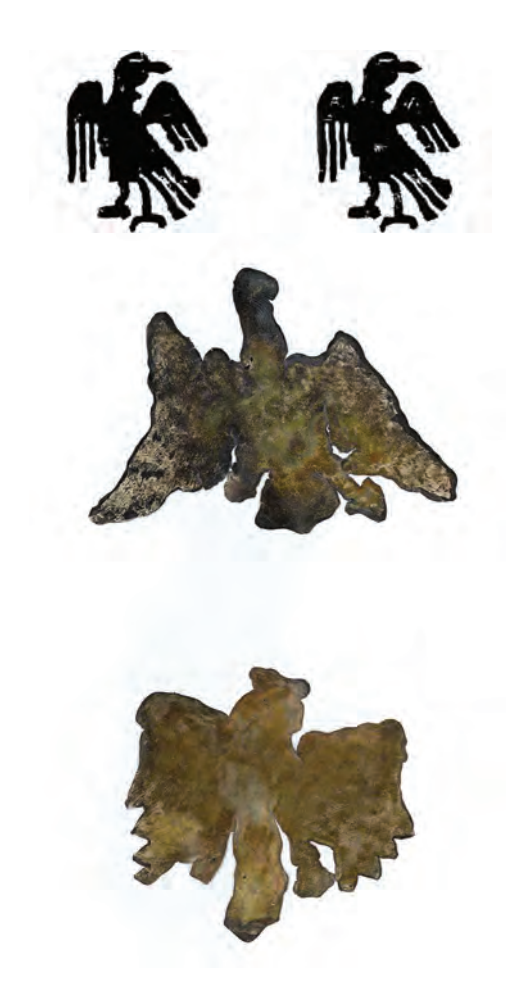
Figure 1. Eagles from coins - embodiments of hybrid identities.

To most of you it won't come as a surprise that I am German. Nevertheless, my second statement might be slightly more unexpected: the fact that I have not become a New Zealand citizen yet.