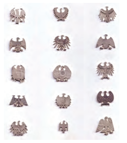
Figure 4. Eagles from coins - embodiments of hybrid identities.

New Zealand, as a former colony with obligations under the Treaty of Waitangi, is very attentive to the particular issues of a bicultural nation; a fact that confronts newly arrived immigrants with some interesting questions. As a German citizen with permanent residence in New Zealand, I am regularly confronted with the complexities of my own cultural 'place-ment.' With my work I wish to address the idea of nationhood and the relationship one has with one's country of origin, as well as the politics that regulate citizenship and national borders.