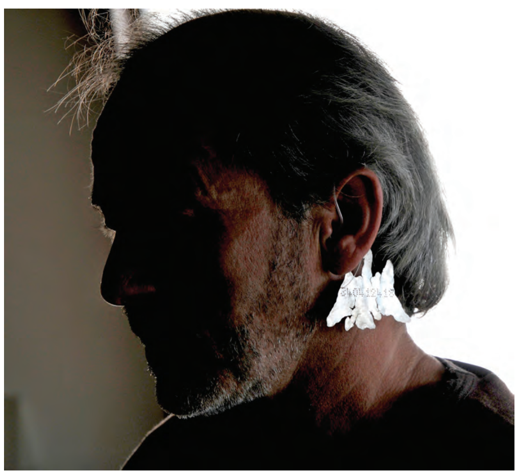
Figure 4. Eagles from coins - embodiments of hybrid identities.

each participant, to whom they will be returned. The pieces are contextualized by portraits of the immigrants and 'passport' booklets presenting their transcribed interviews. Selected drawings from participants will form part of the imagery for the passports I am constructing to make the transcribed interviews available.