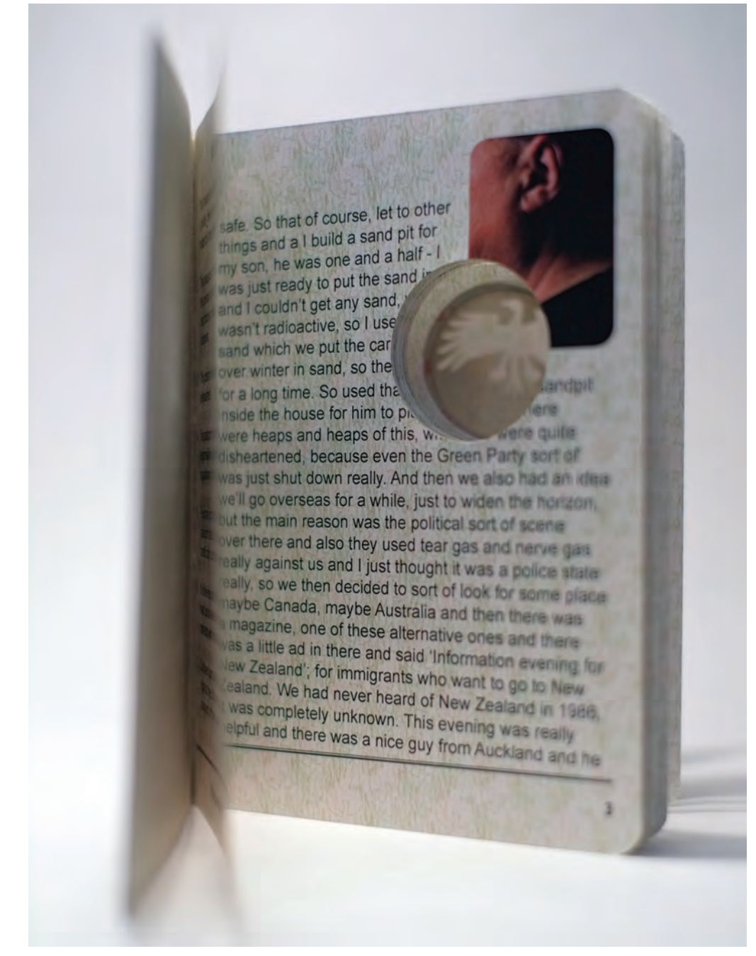
Figure 5. Johanna Zellmer, a selection of portraits from a jeweller's point of view.