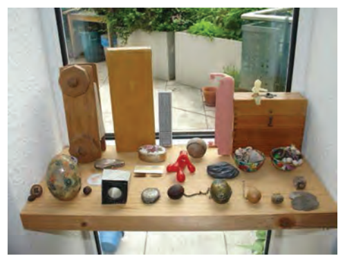
Figure 3. Alessandra Pizzini, personal items which can function as talismans.

Forms, materials and processes are chosen in an attempt to capture the affective tone of these transitional moments. Alessandra's methodology draws the audience into the experiences and emotions embedded in these objects without decoding their secrets completely. In doing so, she explores the way in which belongings can become spiritual, emotional and almost bodily habitats. By de-contextualising these objects and 're-placing' them within the exhibition space, she invites the formation of new relationships and alternative interpretations, simultaneously affirming and subverting their semantic power.