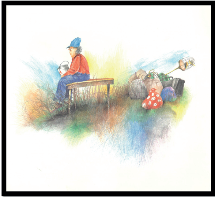
Figure 2. Old Henry- open to communication

I find the value of using this picture book as a learning tool is in actively reading it aloud, interspersed with a range of rhetorical questions designed to encourage student reflection, to unfold the differing perspectives, and to relate the illustrations and concepts to practice situations. For example in the illustration above, the overflowing letterbox instigates discussion about how to communicate with clients in a way that is meaningful to them; the letterbox is both a barrier to communication, and the marker of the boundary of Henry's sanctuary. In the second illustration (Diagram 2) – the last of the book, Henry is homeless, but the letterbox is clutched tight, like a reminder of the home he felt driven from; and a conduit for reconciliation. Henry shapes where he lives, but it is a reciprocal arrangement.