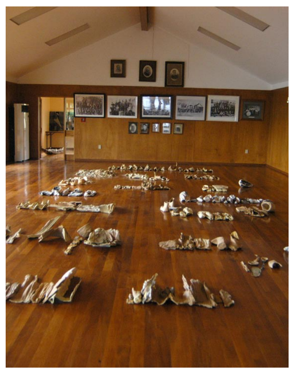
Figure 7: Exhibition, Whareenui Kāti Huirapa Rūnaka Ki Puketeraki Marae, September, 2008