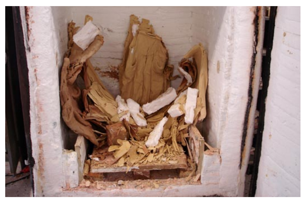
Figure 3: Shards of work in the opened kiln (photograph by the artist).

The next stage was firing. I was told not to have expectations as the firing process is always unknown and at times hazardous. On opening the gas kiln, I was, however, faced with a total collapse of the work, a kiln full of shards and fragments of the garments – all beautifully fired, but metamorphosed. I was horrified at the disaster, but quickly realised there was no time or space for lamentation. An instant mental transition was required – to see it not as I had planned or expected, but rather as the reality of what was in front of me: not necessarily the end of what had been, even though in one sense it was, but rather as a new beginning – new life contained within the old, only apparent after the ordeal by fire. More importantly, I could instantly make the connection with aspects of my own personal inner experiences after coming South. I had to allow myself to enter into an experience of relinquishing control of a situation, producing a result unable to be programmed or foreseen: moving into the unknown, taking risks, picking up the pieces afterwards in order to make some sense of and gain understanding from the experience. This experience involves seeing matters in a different light, in ways we have not been able to see them before. I had developed new eyes to view with after letting go of my original ideas. In this process the work came to speak succinctly of my experiences of partial identity disintegration after travelling South.