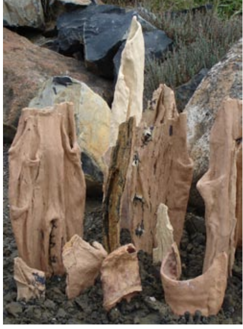
Figure 5 & 6: Fired pieces laid out at on the foreshore