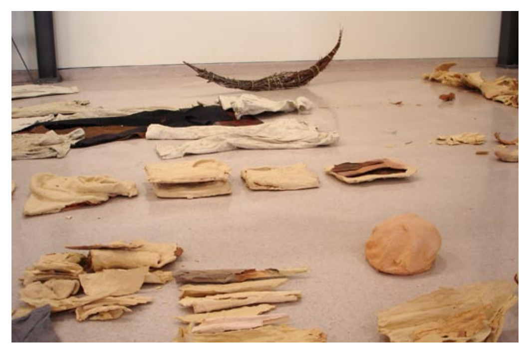
Figure 4: Practice layout.

What are the qualities that give a place meaning? What makes a place special, a landscape important, valuable, unique? What makes a particular place worth caring about – worth caring for, and conserving for future generations?...Some places are obviously so distinctive, so extraordinary in their sheer physical insistence that they immediately capture our spirits and our imaginations...Many places derive meaning and significance from their ecology – their natural characteristics and values...There are also sites of exceptional archaeological importance, sites of pre-history which have value for scientific and palaeontological research – caves and cliffs with moa bones and older fossils...another, perhaps less easily quantifiable set of criteria [exist] for meaning