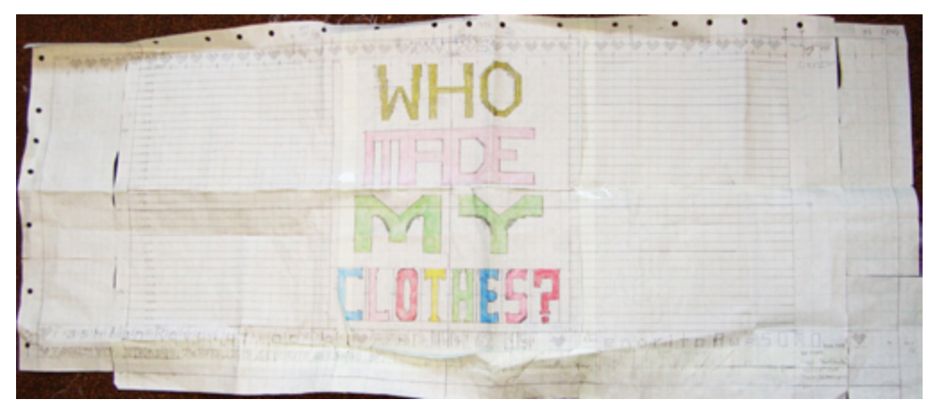
Figure 9 Working pattern for korowai.