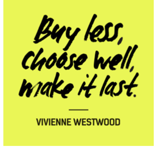
Figures 2-5. Be Curious, Find Out, Do Something! A call to action to all consumers from Fashion Revolution Day.