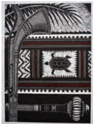
Figure 3. David Teata, Viti , 2005. Woodblock, 705 x 500 mm. On Loan to the Dunedin School of Art.