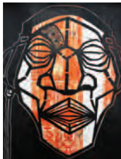
Figure 8. Tere Moeroa, Faces , 2009. Mixed Media Print, 675 x 510 mm. On Loan to the Dunedin School of Art.