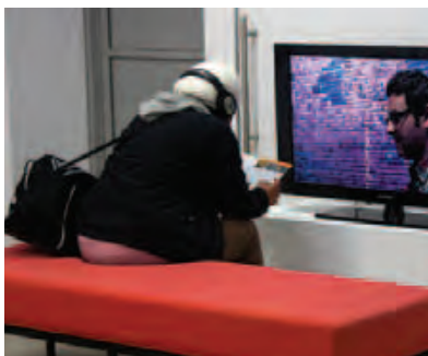
Figure 7. Paranesia (installation view of opening night)