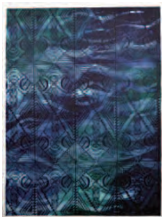
Figure 2. Bridget Inder; Running in the Rain (Displayed in Room P152), 2004. Woodblock over Monoprint, 760 x 565 mm. Collection of the Dunedin School of Art.