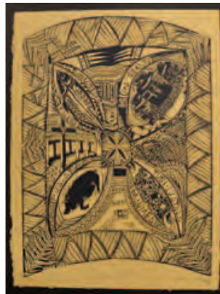
Figure 4. Michel Tuffery, Matai 'Fa Samoa' , 1987. Woodblock on handmade paper 836 x 615 mm. Collection of the Dunedin School of Art.