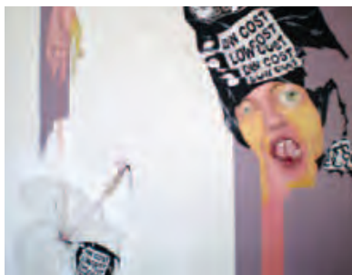
Figure 6. Teina Ellia, Death to Disco , 2012. Oil paint, acrylic paint, graphite pencil on canvas, 755 x 760 mm. Collection of the Artist.