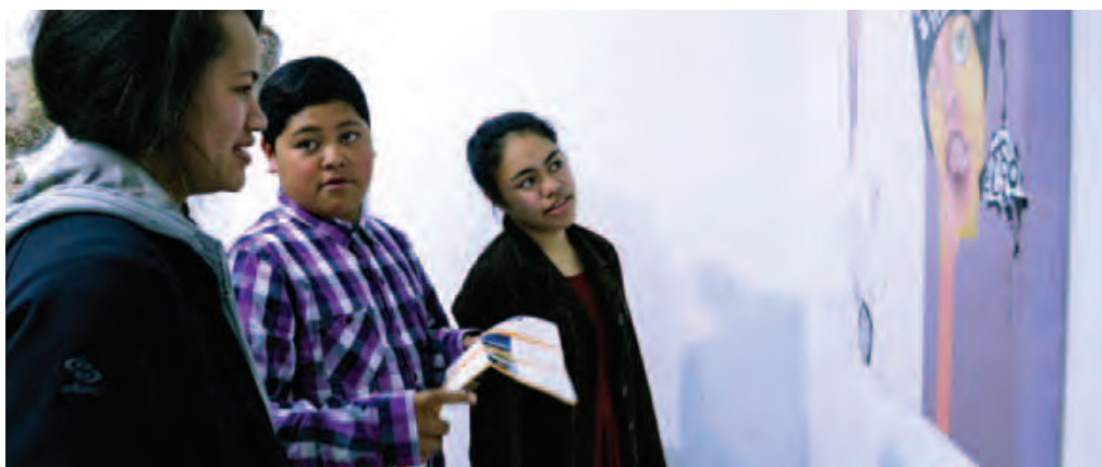
Figure 13. Opening night guests look at a work by Teina Ellia.