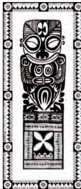
Figure 9. Donald Harman, Scale design for Tapa Window , 2009. Digital Print, 1680 x 725 mm. Collection of the Artist .