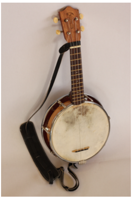
Figure 2. Jane Venis, The Banjolele in Morris Minor (2014). Front view.

In poorer communities where players could not afford expensive manufactured instruments, banjos were often made from scratch from whatever materials were available.Various banjo styles and instruments developed over time, including both four and five-string versions with varying neck lengths. The most notable playing style change was the adoption of a 'new' finger-picking style learned from guitarists that spread during the time of the American Civil War.<sup>10</sup> This new approach helped the banjo gain a reputation as a more genteel instrument which was now touted as suitable for ladies to play.<sup>11</sup> During the 1920s, Dixieland jazz also incorporated the banjo as a strummed rhythm instrument, as its loud 'voice' could be heard above the brass instruments.