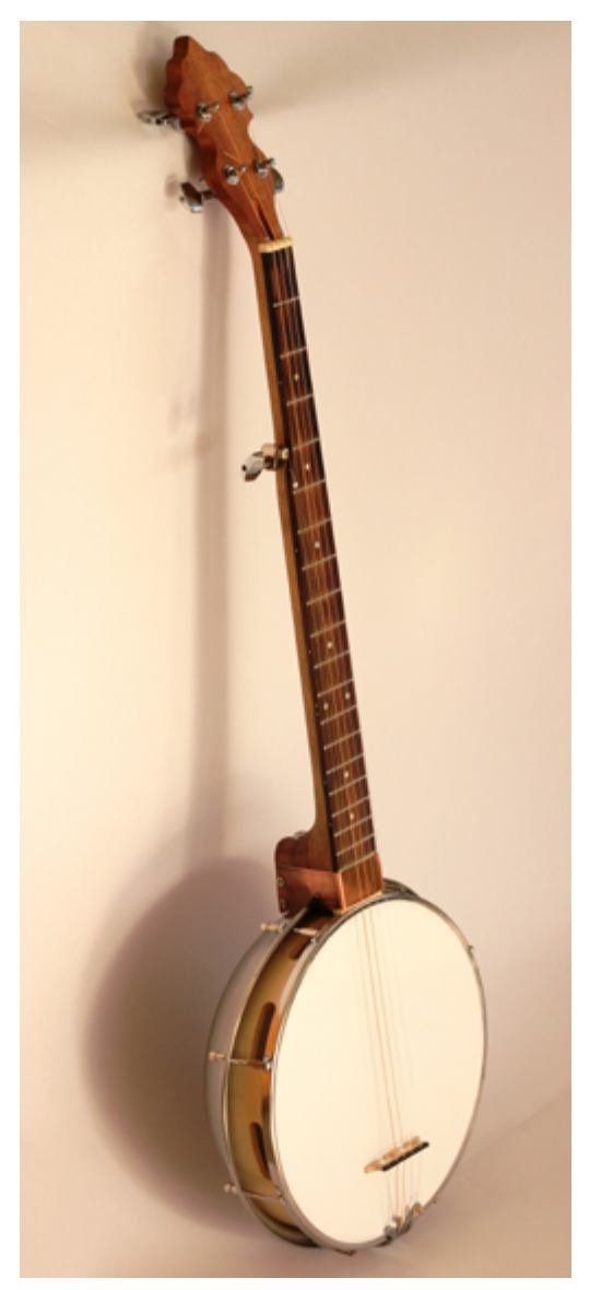
Figure 4. Jane Venis, The Panjo in progress, 2015.

Skills learned in the making of the banjolele have been very useful when creating The Panjo , which is a fivestring banjo with a full-length neck. The Panjo has a tailpiece made from a fork and also uses a copper-