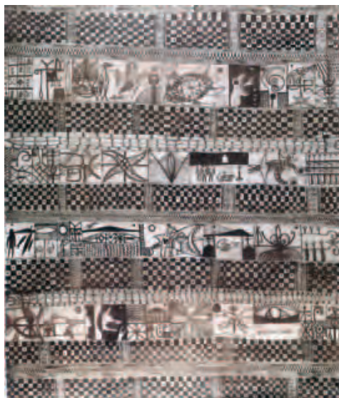
Figure 2. John Pule, Nofo tata kehe tau lima haaku (1996), oil on unstretched canvas, 2200 x 1820 mm. 35 Courtesy of the artist. (John Pule)

The workshop format enabled learning at one's own pace, but it can also provide motivation for the most innovative to stay ahead of others. Like Toganivalu, Josaia McNamara was inspired by Pule's artistic style, but McNamara began painting contemporary compositions derived from customary imagery on blank masi before joining the Oceania Centre or meeting Pule. While McNamara's early paintings alluded to the 'architecture' or grid format of Pule's paintings, the workshop led by Pule in 2001 prompted him to move beyond the grid format to more complex arrangements, most likely influenced by Pule's own progression away from grid formats. Although McNamara did not specify as much, I believe that seeing several other artists imitating the grid style also motivated him to reinvent his approach, retaining the narrative elements but expressing them in a more dynamic way. He achieved this by intersecting and overlapping shapes within an organised spatial design, as seen in The Eyes of the Star Compass (2001) (Fig. 3). This work shows that although McNamara no longer relied on a grid format, he retained forms and motifs derived from masi as well as the colour scheme.