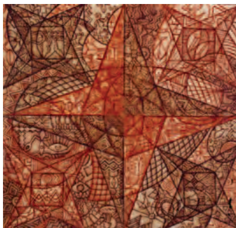
Figure 3. Josaia McNamara, The Eyes of the Star Compass (2001), oil on canvas, approximately 1000 x 1000 mm.

While several art schools exist today, in the 1970s and 1980s there were few, and many of the Pacific Islands still do not have art schools. Therefore, for artists like the majority of those that participated in the workshops described above, the workshops were an opportunity to receive critical instruction and training to develop their art. The case studies illustrate how