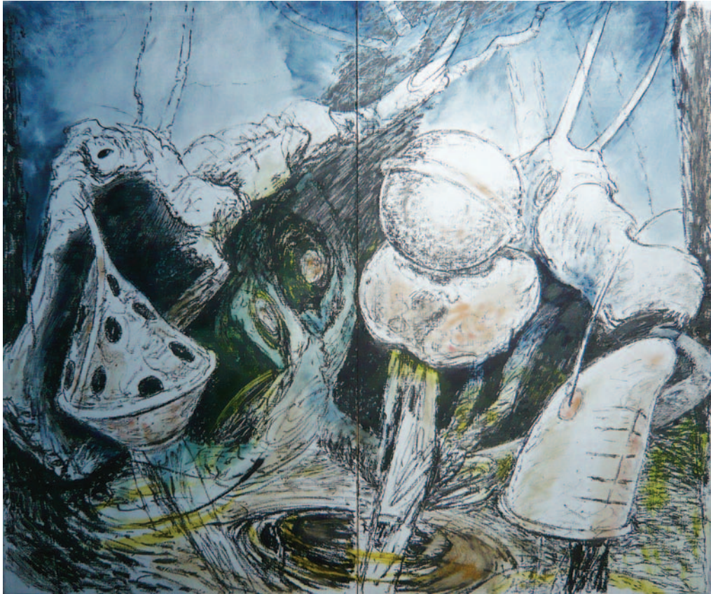
Figure 3. Peter Belton, Iron in the Forest (2010), coloured drawing, mixed oil media on board, 100 x 120 cm.