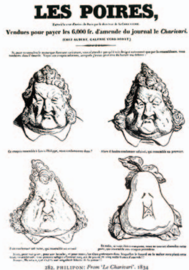
Figure 4. Honoré Daumier; Les Poires (1832), caricature of King Louis-Phillipe of France. Illustration, Le Charivari , ed. Charles Philipon. From EH Gombrich, Art and Illusion (London: Phaidon, 1960), 291.

The illustration reproduced below is, however, an example of an artist working an idea from a schema into the particulars of a caricature. We might ask, is it the drawing of a pear which reminds us of King Louis Phillipe, or is it the image of King Louis Phillipe which reminds us of a pear? In New Zealand it is not uncommon to hear an impractical intellectual type described as an 'egghead.' In nineteenth-century France one pejorative term for an idiot was 'pear;' perhaps the closest English equivalent is 'fathead.' Through the illustration, the artist shows a progressive metamorphosis from royal physiognomy to fruit – as, indeed, today we also describe somebody who is silly as a 'fruit.' These images first appeared in the satirical paper Le Charivari in 1832 and earned the publisher, Charles Philipon, a spell in prison for libel.