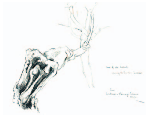
Figure 2. Peter Belton, Dotard (2010), zoomorphic sketch from a photograph of an ancient beech tree. From S Schama, Landscape and Memory (London: Fontana, 1996), 531. Artist's 2010 Journal (1).

Michelangelo's contemporary, Leonardo Da Vinci, in his Treatise on Painting , exhorted students (and here I paraphrase) to look at walls splashed with a number of stains of various mixed colours. This is when you may find there some resemblances to a number of landscapes, adorned in various ways with mountains, rivers, trees, plains, valleys and hills. Moreover, you can see various battles, and figures in rapid action – and that these happenstance stains invite being read into and elaborated. 1