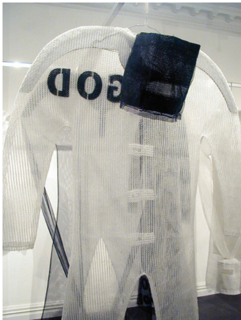
Figure 3: Neil Emmerson, The Glass Closet , Installation view, ROCDA, Princes St. Dunedin, 2009. Plastic/nylon, various threads, zips, enamel paint and aluminium suspension system. Dimensions variable.