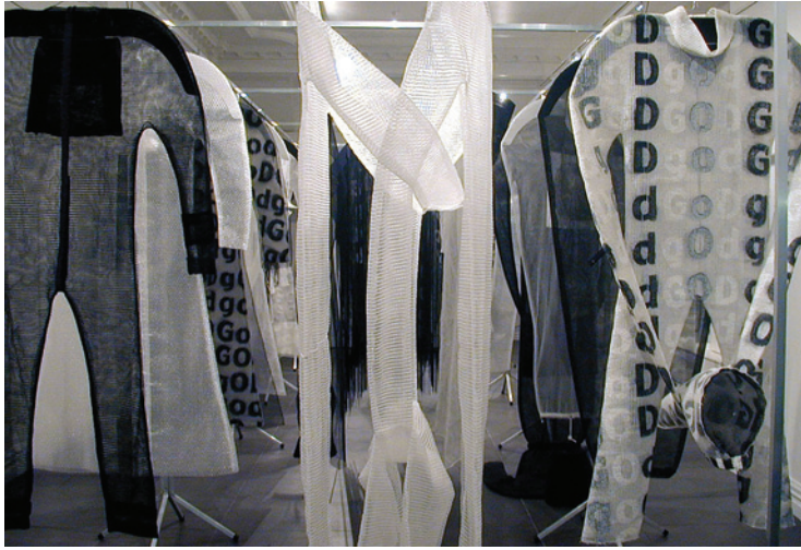
Figure 2: Neil Emmerson, The Glass Closet , Installation view, ROCDA, Princes St. Dunedin, 2009. Plastic/nylon, various threads, zips, enamel paint and aluminium suspension system. Dimensions variable.