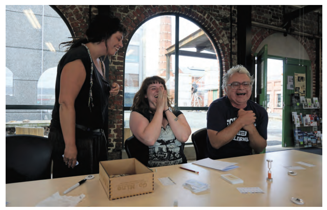
Figure 2. Cut-throat tycooning: first day of game launch, 2017.

The players are invited to embrace the corporate tycoon within by mining the 'planet' deck of cards, winning one over their opponents, and gaining power through the bribing of political figures and those in position of authority. Through the application of a gaming mechanism called 'nomic,' l players are invited to participate in the game-making process by creating new rules and amendments to established rules during 'conference calls.' During their turn, players can approach the group with a suggested rule change within a fixed amount of time, dictated by the sand-timer. Should the rule change receive a majority vote, it becomes ratified on the next player's turn.