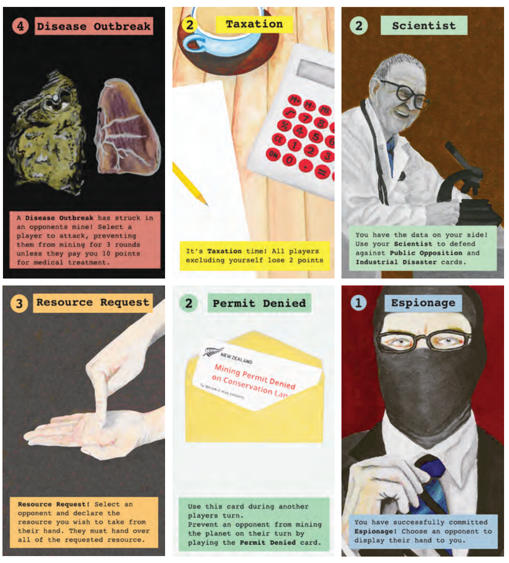
Figure 6. Ruth Evans, Go Mine: a selection of 'action' cards, 2017, card, 89 x 57 mm each.

The Resource Request zine explains how the project Go Mine came to exist, providing the reader with an understanding of games as an art medium and tool to educate, discussed in the context of my own project and the work of others.