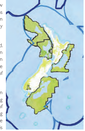
Figure 5. Ruth Evans, Go Mine: back of 'planet' deck, 2017, card, 89 \times 57 mm each.

Gold mining has undergone many changes in New Zealand since it began in the mid-1800s. The Gold zine records the fluctuating industry and mining methods from early planter mining in rivers and underground mining of hardrock, to contemporary opencast operations. The future of gold mining is contemplated with reference to the current explorations taking place in Puhipuhi, in the Far North. The public opposition to this operation is discussed, and opponents' slogan of "no toxic mining" is explained.