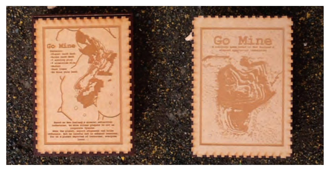
Figure 1. Ruth Evans, Go Mine game box, 2016, mdf, 226 x 162 x 80 mm.

Go Mine is a multifaceted project which critically explores New Zealand's mineral extraction industries, both historically and in terms of the contemporary context. The project consists of three components: a tabletop game, a collection of folk songs, and an anthology of zines. While these three elements work together to provide the audience with a broader understanding of the conceptual elements in the project, they can also stand alone in their own right. The zines are educational and informative. They appeal to the rational faculties of their audience. The music is emotive and universally accessible, with the ability to reach a wide audience through various formats, such as live shows and busking, and through recording dissemination on the internet and in the physical realm. The game conjures up a combination of both rational and emotive responses to the reality of climate change