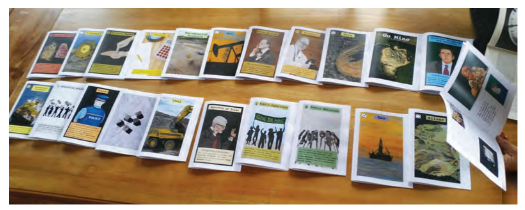
Figure 3. Go Mine zines in the Dunedin Gasworks Museum library, 2017.

On the cover page of 20 of the zines within the anthology, a card face from Go Mine has been used, establishing a direct link between the zines and the game itself. The exceptions to this rule are the three zines Go Mine: An Introduction (which provides the reader with some background to my political art practice, and an abstract of the project and zine chapters), Songs of Go Mine, and the Aluminium zine.