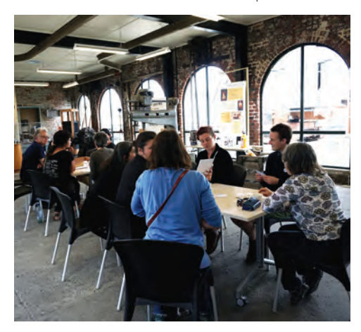
Figure 9.Two tables of gaming: first day of game launch, 2017. Photo: Pam McKinlay.

location for the "Go Mine Game Launch" exhibition. Two tables were set up to allow the public the opportunity to play the game. A wall was installed where the components of the game were displayed, allowing visitors the opportunity to engage with the work, even if they did not wish to play the game. The Bribe and Planet cards were fixed to the wall, while the dice, timers, pins, maker, rule book, box and insets rested on a shelf. The anthology of zines