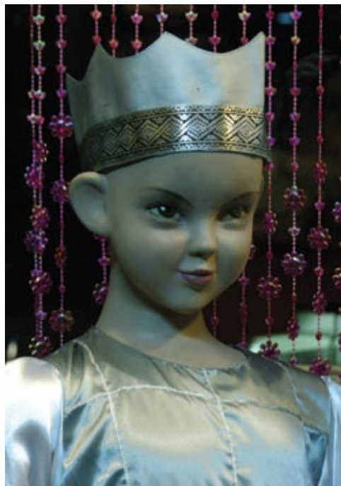
Figure 1: From the Postcard Series , 2007.

On the 26th of June 2007 I was spat out of a whale on Tomahawk Beach.