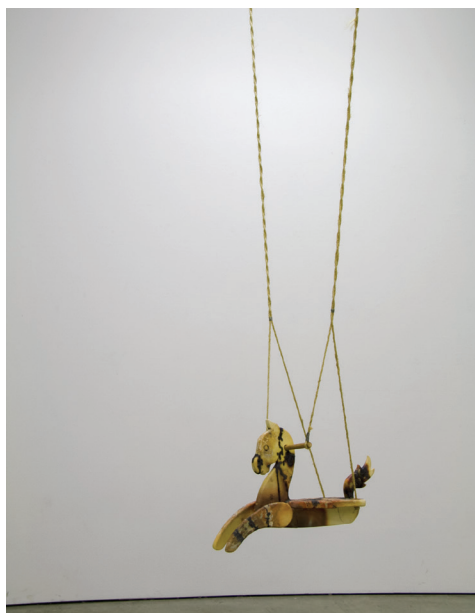
Figure 13. Bronwyn Gayle, Swing , 2022, saggar-fired clay, wood, rope.