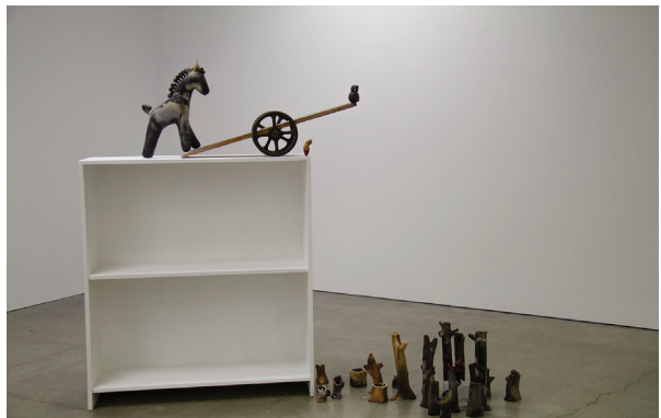
Figure 4. Bronwyn Gayle, Infant Red and the Call of the Cloak , 2020-22, saggar-fired clay, wood, cast glass and re-imagined metal additions on bespoke bookshelf plinth. Ceramic pony approx. 400mm height.