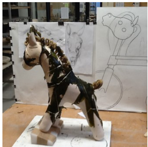
Figure 7. Bronwyn Gayle, 2022, pre-fired and wrapped ceramic pony from Infant Red , with drawings.