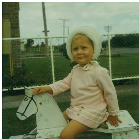
Figure 1 & 2. Childhood photograph.