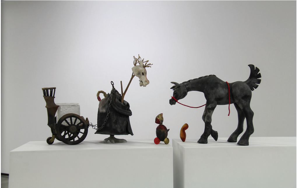
Figure 10. Bronwyn Gayle, The Conflicted Chronicles of Grown Red , 2021-22, saggur-fired clay, wood, string, cast glass and re-imagined found additions on bespoke bookshelf plinths.