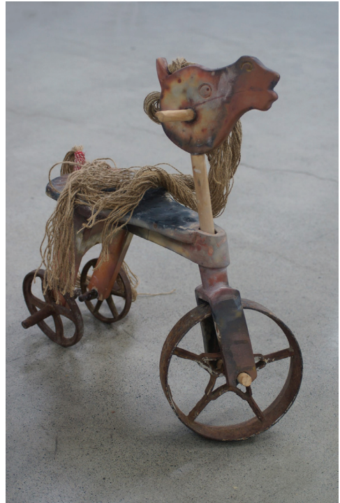
Figure 6. Bronwyn Gayle, Trike , 2022, saggar-fired clay, wood, string and re-imagined metal additions, approx. 550mm height.

The combustibles chosen for my firing include horse dung, horse hair and waste hay. These items speak directly of the practicalities of caring for horses – not the aesthetics of the horse lover's calendar, but instead the result of caring for real rather than imagined horses, placing value on the mundane and the discarded. Other combustibles include seaweed and seashells from beaches on which Pepper and I both escaped our mental and physical confinements and grew to know and trust each other. Some contributions to the saggar-firing process, notably dung and seaweed, reliably left their mark through the interaction between clay and fuming combustibles. However, other flammables, such