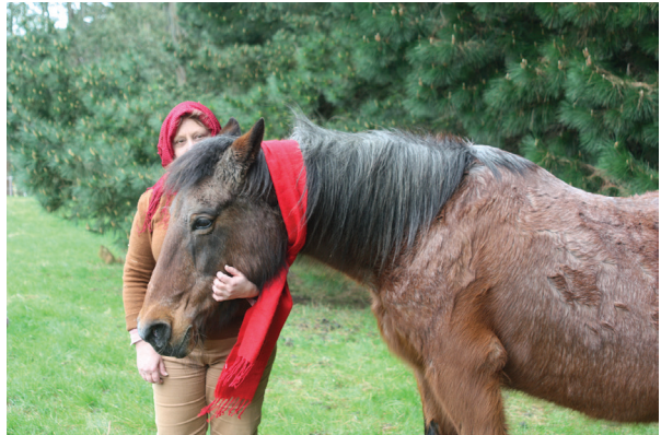
Figure 3. Pepper and the author. Photograph: Denise Cone, 2021.

Over the course of the project, Little Red's steadfast companion morphs like an equine Pinocchio from a generic child's toy into an individual creature. The equine in toy and fairytale became a vehicle with which to explore historical perceptions and experiences of human/equine relationships. These perceived realities are coloured by historical precedents and individual experiences. Alexander Nevzorov states: "By any stretch of the imagination, it is very difficult to find a subject more steeped in deception than the relationship of man and horse." 1