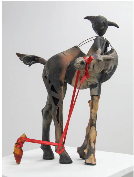
Figure 14. Bronwyn Gayle, The Entanglement Before the Fall , detail, 2021-22, saggar-fired clay, cast glass and found objects on bespoke bookshelf plinths.