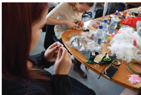
Figure 4. Colab 1-5. Collaborative making full of unexpected symbioses at Hungry Creek Art and Craft School.

graphics were both a take-away and tangible record of CLINK's endeavours to broaden public engagement with contemporary jewellery practice.