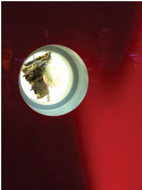
Figure 6. PEEP: Peeking through Te Uru's covered street access window box for a glimpse of the jewellery objects to be given away to members of the public.

This third iteration of the CLINK Project once again provided an intensive learning opportunity through experiencing contemporary craftwork at first hand. The project presented professional networking opportunities, as well as the awareness of belonging to a wider community of craftspeople who inherently embrace a philosophy of generous sharing. Last but not least, CLINKproject3: Collaborism compelled the participants to not only be artists and curators, but to also collaborate as writers; this project report bears the fruits of a final writing workshop gathering. On reflection, our own experience of interaction with other professional speakers and makers mirrored the engagement we provided for the wider public in Te Uru's gallery setting.