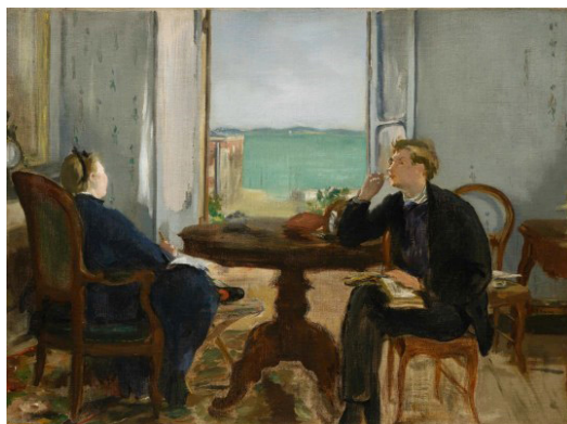
Figure 3. Edouard Manet, Interior at Arcachon , 1871, oil on canvas, 39.2 x 54 cm. Clark Art Institute, Williamstown, MA.

While both Manet's work and mine takes people with whom we have close relationships as subject matter, our work is set in very different surroundings. While Manet uses formal settings, mine are on the casual side. In contrast with Manet's work, I apply dabs of bright colour amid the darker hues (of the sofa and carpet, in the case of N.G. Chilling ), a feature I hold in common with Peyton's paintings. The mix of different colour saturations constitutes an invasion of the painting surface. In place of Manet's imprecisely rendered but well-arranged elitist aesthetic objects, the objects in my paintings retain much more detail and are used to bring out the identity of the figures portrayed.