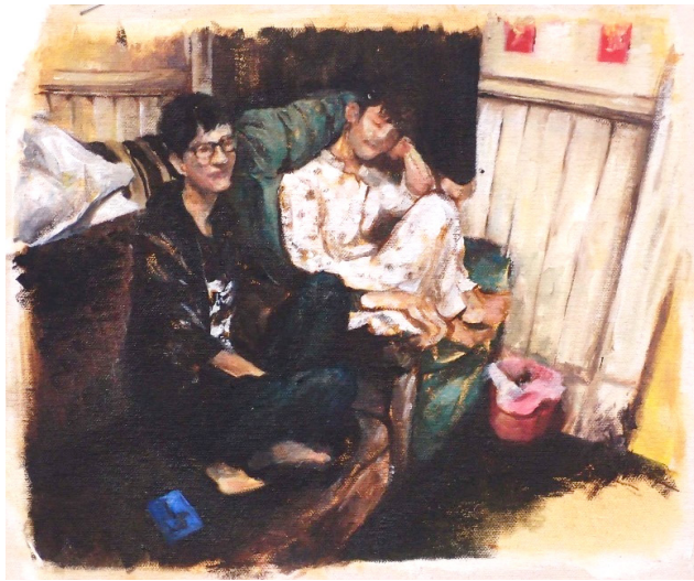
Figure 1. YongWei Lim, Adrian and Ian , 2017, oil on canvas, 23 x 27 cm. Photograph: The artist.

In Peyton's painting, Ken and Nick , two young men are shown resting on a couch. Staring into the distance, their expressions are tired. The man in the dark green shirt has a book on his lap, suggesting that he has been captured by the artist during a moment of leisure. The postures of both subjects are very relaxed. The simplicity of their clothing and the detailed patterns on the couch show that the artist has put some thought into the patterns and textures used in the painting.