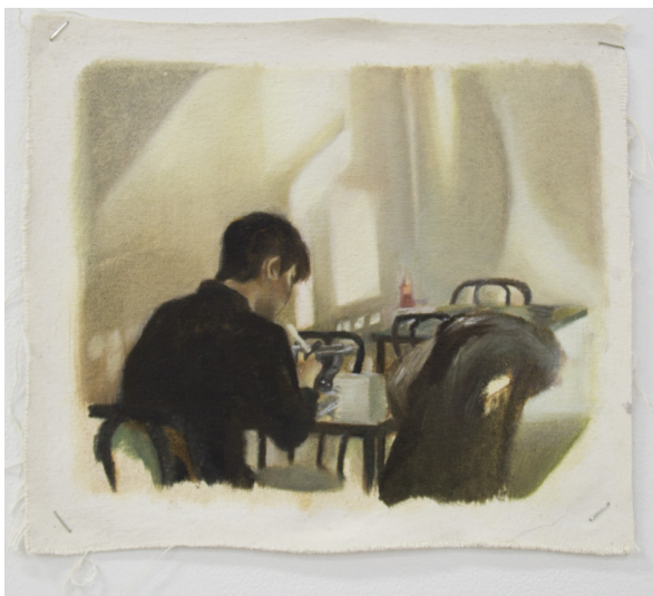
Figure 5. Yong Wei Lim, Jia Hui , 2017, oil on canvas, 18 x 22 cm.

On the other hand, our representational techniques differ significantly: his stripped-down visual repertoire is less complicated than mine. In my paintings, spaces are filled with objects. These details are the elements I use to tell a story, while Tuymans' focus is on space and colour. 23 While Gas Chamber is a small painting of a large space, my works show intimate domestic spaces. Above all, whereas his paintings are imbued with a sense of horror – they can be very disturbing if one explores the stories behind them – my works chronicle cosy moments of daily life. In order to invite the viewer to construct their own narrative, the repeated appearance of certain objects can be crucial. For instance, in my paintings lounge rooms, food, knick-knacks and people are found again and again. Finally, giving a painting a suitable title is the key to unlocking the meaning of both Tuymans's and my paintings.