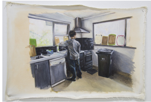
Figure 7. Yong Wei Lim, Lik De in Kitchen , 2017, oil on canvas, 38 x 53 cm.