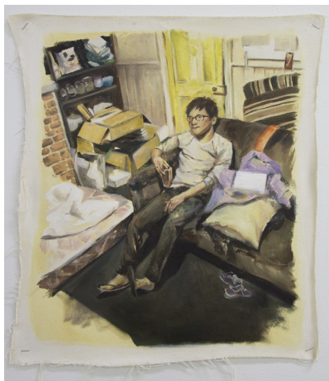
Figure 4. Yong Wei Lim, N.G. Chilling , 2017, oil on canvas, 41 x 35 cm. Photograph: The artist.

At the same time, our painting styles share some similarities. The intimate size of my painting focuses on a moment in life, as does Manet's. In addition, the way that the brushstrokes are loosely applied contributes to the calming ambience displayed by each of these works. Correspondingly, the use of low-saturation colours creates a sense of depth that allows the audience to feel the calmness in the work. At the same time, the figures in both paintings are grouped near the centre of each work.