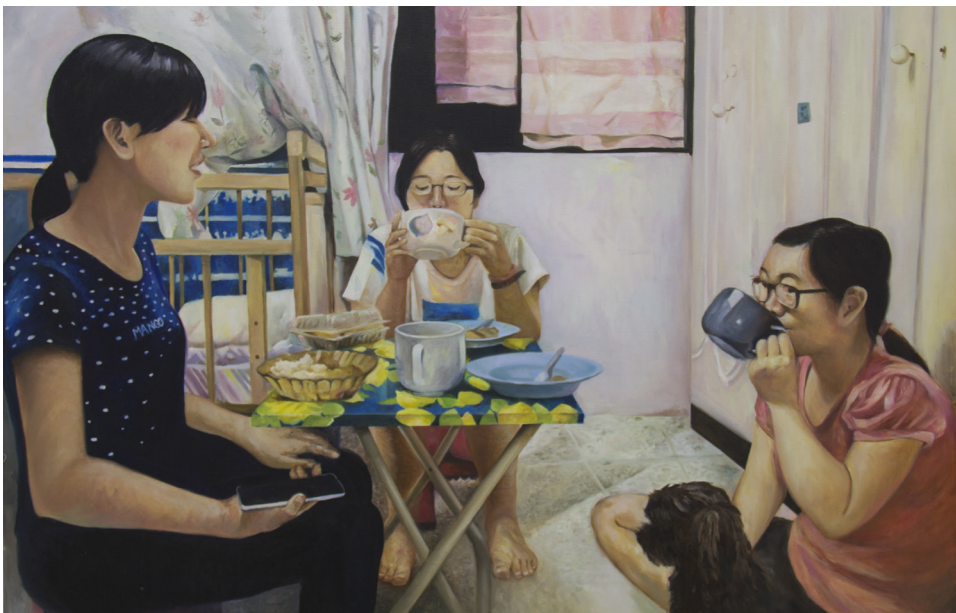
Figure 10. Yong Wei Lim, Dining in Fiona's Room , 2018, oil on canvas, 35 x 55 in.