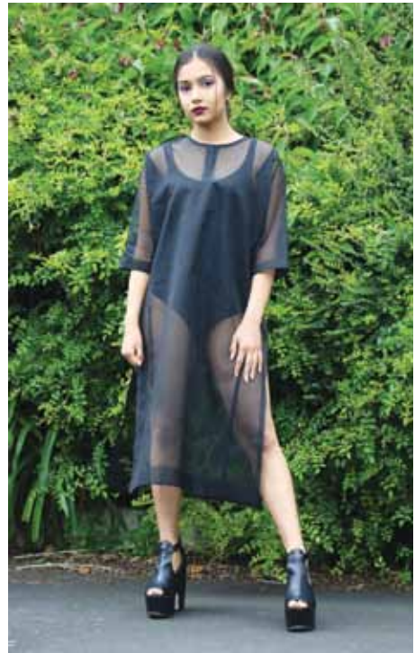
Figures 2 and 2b. Kurta in full-size 10, organza fabric, 2016, Rekha Rana Shailaj.