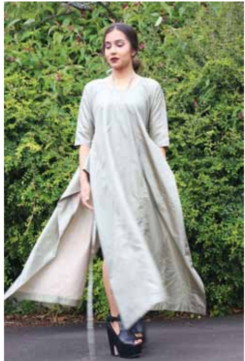
Figure 7. Kurta dress variation, 2016, Rekha Rana Shailaj.