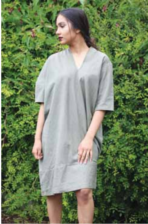
Figure 14. Linen dress, 2008, Rekha Rana Shailaj.