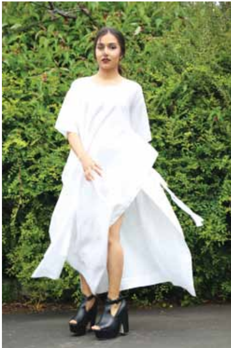
Figure 6. Kurta dress, 2016, Rekha Rana Shailaj.

A4 sized paper lent itself readily to the process of cutting and moulding into new shapes and forms. This unconventional paper modeling method has been used to create a skirt design (Figure 10). The workbook shows the complexity of a design which was conceived from a piece of rectangle and worked out in a true scale of 1:10. The design conceived through paper modeling has been then transposed into the full-size garment in fabrics shown in Figure 11. The ensemble was completed with a kurta top in tussar silk which belonged to my husband and was altered to size 12.