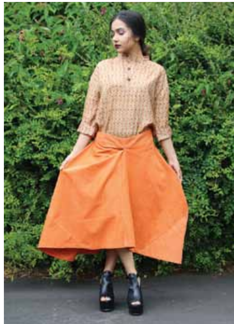
Figure 11. Skirt design, 2016, Rekha Rana Shailaj.