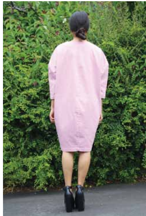
Figures 5 and 5b. Bubble dress, 2015, Rekha Rana Shailaj.