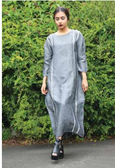
Figure 9. Linen dress, 2016, Rekha Rana Shailaj.