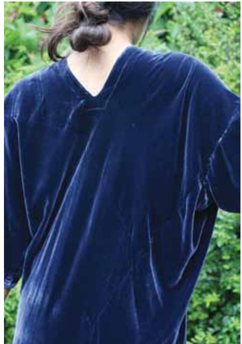
Figures 13a and 13b. Silk velvet dress, 2010, Rekha Rana Shailaj.