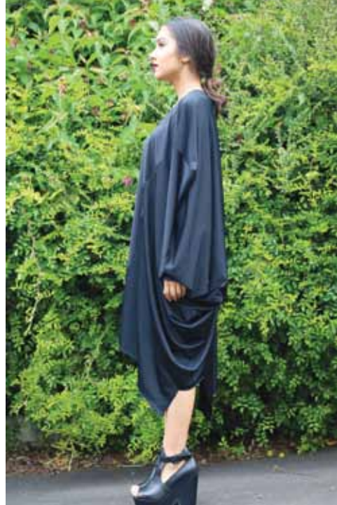
Figure 15. Lycra dress, 2016, Rekha Rana Shailaj.

Other geometric shapes besides the rectangle can also be used to fit the form of a body. Potential designs are not limited to a few shapes; they can be extended to other geometric shapes. Two shapes, a rectangle and a semi-circle, were draped to create the designs shown in Figures 12a and 12b. Different weights and compositions of fabric were used to create these design iterations.