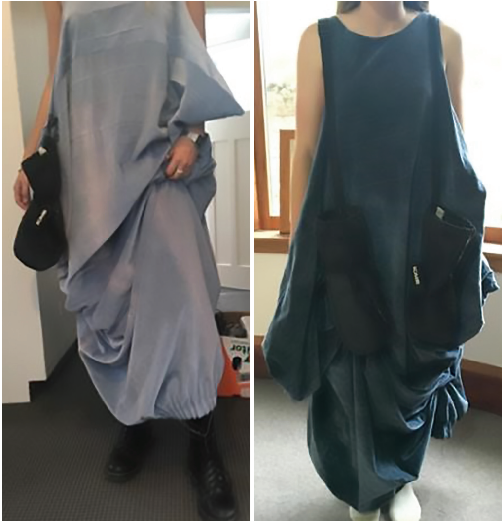
Figure 4 and 5. Gràinne O'Connell, Curtain Dress transformations.

Originally a pale blue, I decided I wanted to change the colour to match the rest of my pieces. I used fabric dye to try and achieve a deeper blue, but when this proved unsuitable, I spray-painted it black, working as the bricoleur to alter its original function. It can be worn both front and back and displaced to transform the silhouette even further. Following this aesthetic of accretion, 13 the eyelets allow the wearer to hitch the garment up and it can be tied in any way desired. The side filling, a cushioning element, was made from remaining fabric waste and mimicked a sort of sculpture – an upholstery form.