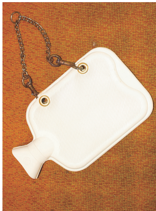
Figure 1. Gràinne O'Connell, Hoisery Dress and Hot Water Bottle Bag . Model: Lola Morten.